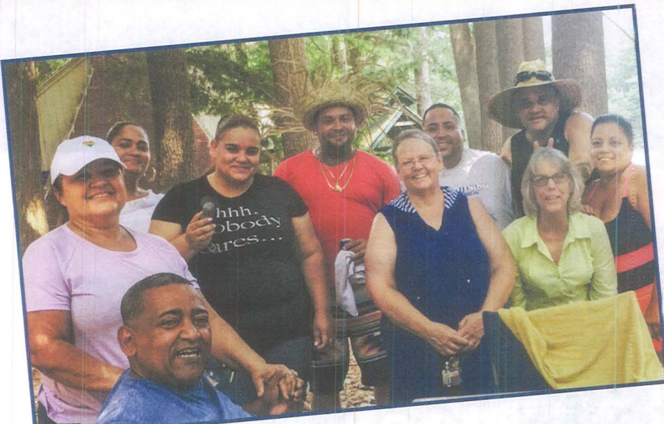
Pioneer Valley drivers celebrate their big organizing win.