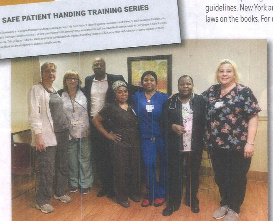
The RWDSU represents an increasing number of health care workers, like these at Silver Lakes Rehab in Pennsylvania, and like all workers they deserve healthy

OSHA does not have standards on lifting and other ergonomic risk factors. But it established a National Emphasis Program for Nursing and Residential Care Facilities in 2012 and has a number of very useful resource materials on their website: (www.osha.gov). The National Institute for Occupational Safety and Health also has valuable resources on their website: (www.cdc.gov/niosh). An additional excellent training resource is "Introduction to Safe Patient Handling" which is available at: www.wnycosh.org.